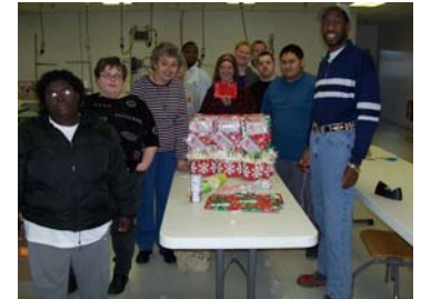
LSE Production Team