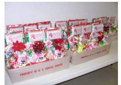
Done and ready to sip!! Awesome Job Crew